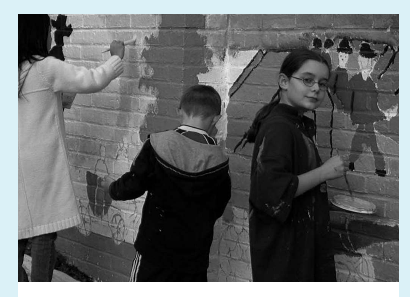
One of the groups we gave money to is APORENet

They use art to tell people about equality and human rights.